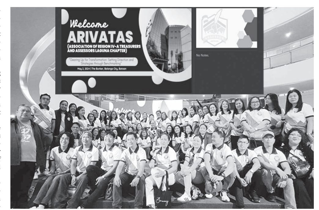
(BLGF Region 3).

Not to mention Computerized Revenue Collection, Disbursement and Reporting with Electronic Transmission of reports by different local agencies, up to their submission to the Bureau of Local Government Finance