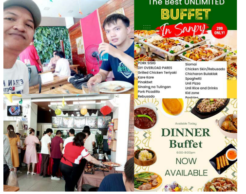
BY: PAOLO MANUEL C. FULE

We Filipinos are very fond of eating, as almost all occasions that we have, sharing good food on the table has become a Filipino staple especially when it comes to Filipino dishes and viands. With that being said, one of the finest restaurants in the City of San Pablo offers a delicious and mouth-watering treat every food loving person should not resist. Hot Side Resto Bar located at Maharlika High Way San Rafael, San Pablo City, offers its unlimited buffet and it has since attracted customers who love to dine and share good food. Let us take a peek of their humble beginnings and what is in store for you food lovers.