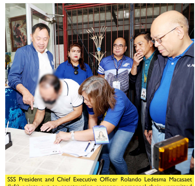
(left) points out to construction company personnel their unremitted contributions in Barangay Teacher's Village East, Quezon City.