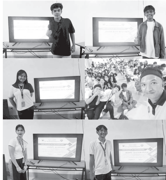
The culminating activity of Grade 9 Amethyst, Jade, and Pearl commenced on February 15, 2024 at San Jose Integrated High School for their commercial making of local restaurants in San Pablo City.