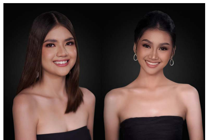
BY: PAOLO MANUEL C. FULE

Behind the glitter, glamour, and flashing lights in beauty pageants, the spectators, audience, and supporters give the royal feel and excitement in such a crowd vying for the crown. Let us support these two young women who will vie for the crown of Binibining San studying at Maastricht Universi- Pasarela Trainor: Pasarela PH.