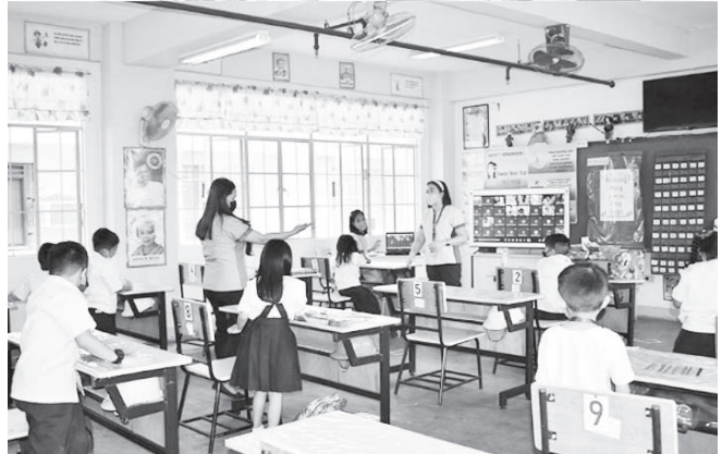
In Hybrid Learning, learners continue learning in Synchronous and Asynchronous Sessions. It lessens the learning gaps instead it enhances discovery, curiosity, and collaboration to achieve the learning goals.

Republic of the Philippines REGIONAL TRIAL COURT 4th Judicial Region Branch 8 Calamba City, Laguna Email Address: fc1cmb0008@judiciary.gov.ph Telephone Number: (049) 520-5149 For Criminal Cases: 0927-072-9916 For Civil Cases: 0910-225-2040